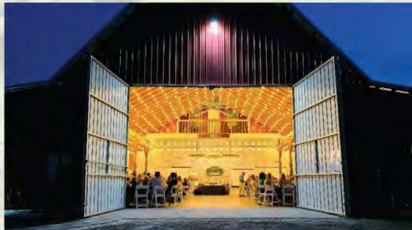
Member Appreciation Dinners hosted in Apopka & Plant City during 2022.